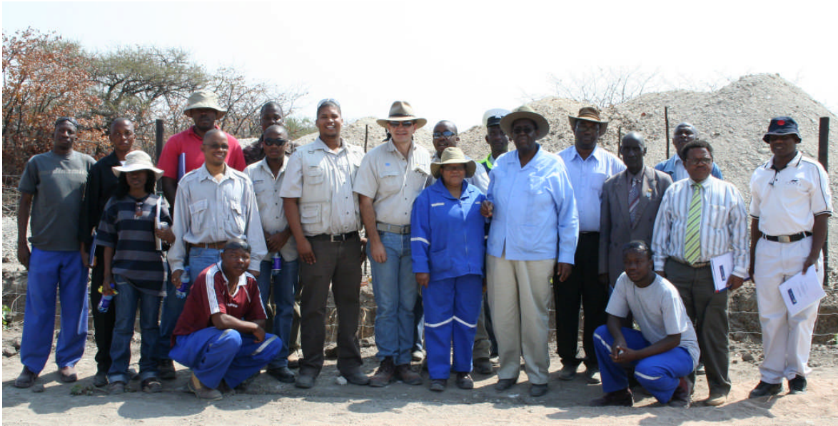
A-Cap staff and visitors in front of exploration trench at Letlhakane Project (The Honourable Minister is standing sixth from the right).